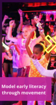
Model early literacy through movement