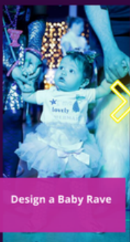
Design a Baby Rave