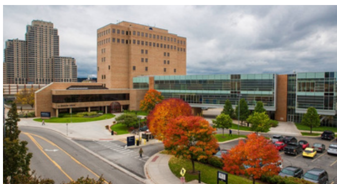
L.V. EBERHARD CENTER @ GVSU PEW CAMPUS 301 FULTON STREET SW GRAND RAPIDS, MI 49504