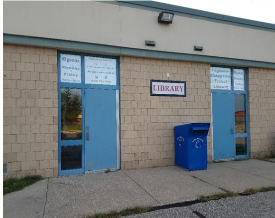
Saginaw Chippewa Tribal Library