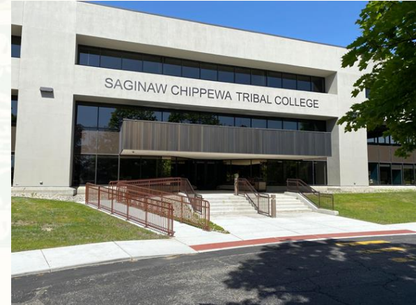
Saginaw Chippewa Tribal College Library