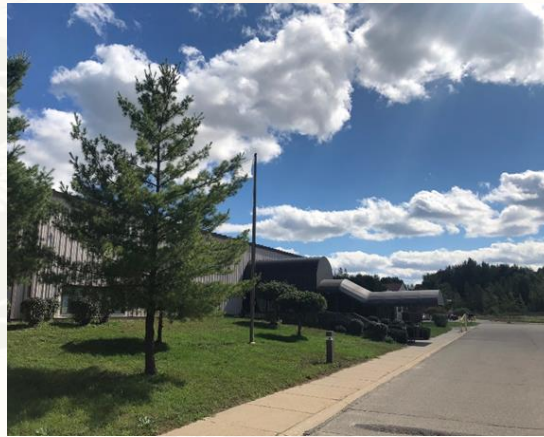
Saginaw Chippewa Academy Library